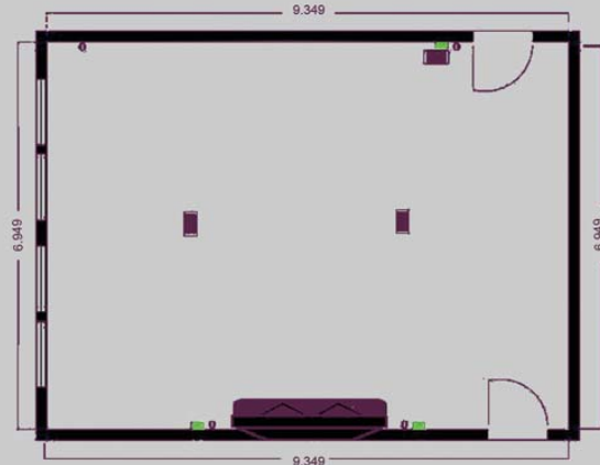
The Nesfield Suite